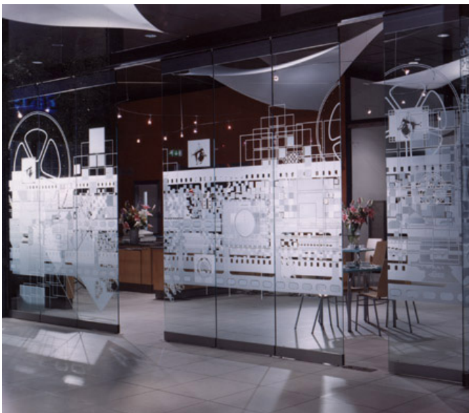
ClearShield not only protects the sandblasted screen from dirt, it changes the tone to that of a more attractive satin

Chris continues: "ClearShield is the ideal solution for protecting decorative glass. A further advantage of ClearShield is that it changes the tone of sandblasting to that of satin acid etching, a much more attractive finish".